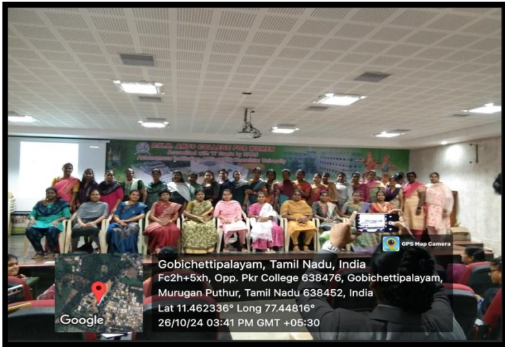
Mega Alumnae Meet on 26.10.2024