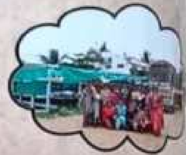
28. Industrial visit on 27.08.2019 to Ariya Plastics-Jawan Pumps, SIPCOT,Perundurai.