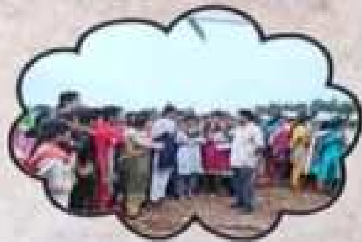
29. Industrial visit on 27.08.2019 to Saravana Polythreads Pvt Limited,Singiripalayam Pirivu,Akkarai kodiveri.