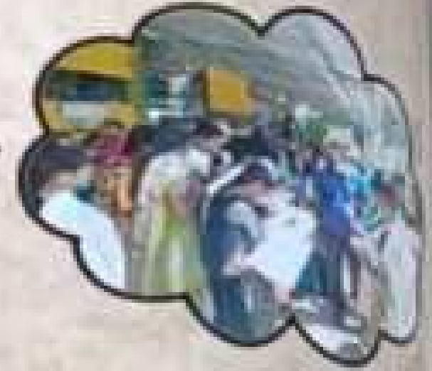
25. Industrial Visit on 24.07.2019 to SVS Granites, T.N.Palayam.