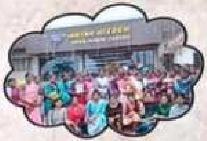
27. Industrial visit on 27.08.2019 to Ariya Hi-tech Pipe component Pvt Ltd, SIPCOT ,Perundurai.