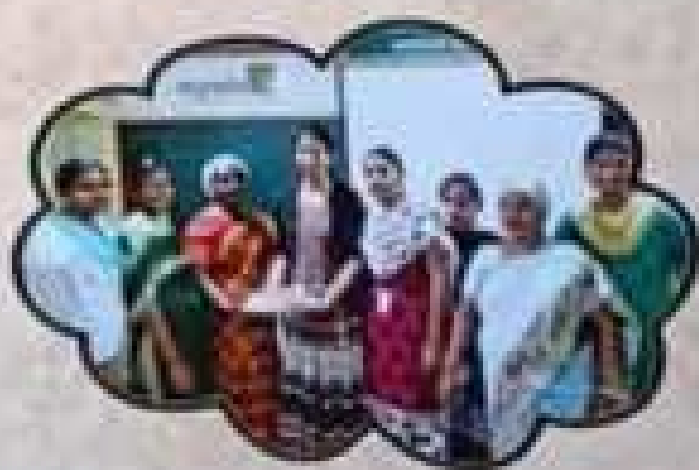
31. Industrial visit on 30.09.2019 to MYRADA Krishi Vigyan Kendra, Gobi.